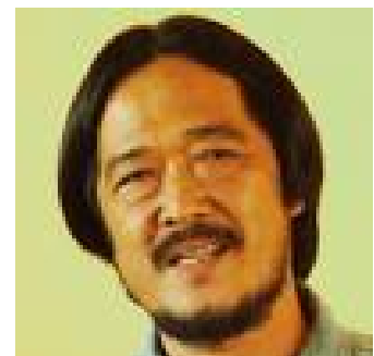
Chart Korbjitti, born 1954, is a highly successful, self-publishing Thai novelist and short story writer with a wide range of styles.

As time went by, Fak became increasingly tormented by his suspicion and dread of the people around him. During the day he wore himself out, but at night he couldn’t sleep. As he became thinner and thinner, the villagers began to call him a bag of bones.